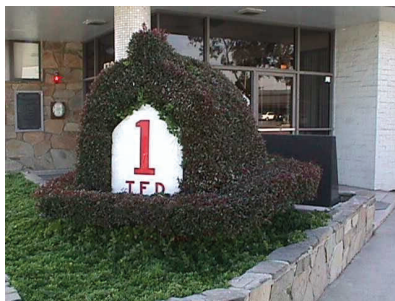
Torrance FD Station 1

Five ALS units serve a population of 150,000 permanent residents – a number that swells to 500,000 during the day. Torrance FD covers 21 square miles - miles that include an airport, freeways, coastline, an oil refinery, and one of the largest indoor shopping malls in the West.