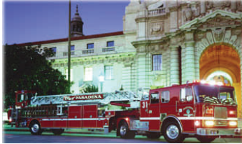
Pasadena FD Headquarters

over 11,000 medically-related calls. Permanent staffing at Pasadena Fire includes over 60 paramedics and 185 EMTs. A two-paramedic rescue ambulance and a fire engine or truck is dispatched to the scene of every emergency medical call, bringing to the scene a minimum of two paramedics and four firefighters, above the standard national requirement for emergency medical calls.