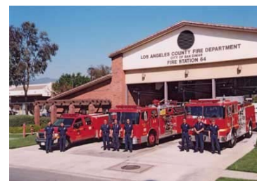
LACoFD Fire Station 64

ing department-wide is a tremendous logistical feat, and an important accomplishment."