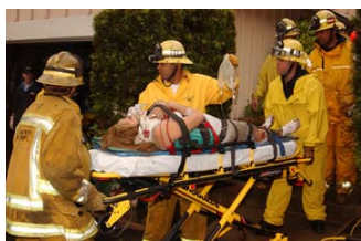
LACoFD paramedics at work

LACoFD came into being in the 1920's as part of the Los Angeles County Forestry Department, and was charged with both preventing and combating fires. Fire Protection Districts were formed, which quickly grew in number and capability, and developed new techniques and equipment to fight fires of all kinds.