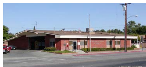
Los Angeles County FD Station 111

At press time, St. Francis Medical Center, Little Company of Mary Hospital-Torrance, and Henry Mayo Newhall are tied for the lead in enrollments with a total of 12 each. UCLA Westwood has received 11 patients, with Methodist Hospital of Southern California, Providence St. Joseph’s Medical Center, and Sherman Oaks Medical Center tied at