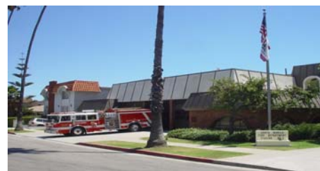
Home of Santa Monica FD Engine 4